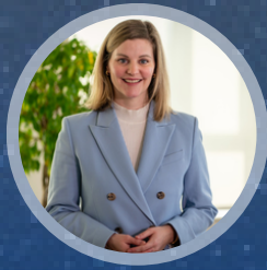
Liesje Schreinemacher Deputy Secretary-General of the Benelux Union

Ms Liesje Schreinemacher currently serves as Deputy Secretary-General of the Benelux Union. From 2022 to 2024 she was Dutch Minister for Foreign Trade and Development Cooperation. Prior to that, Schreinemacher was a Member of the European Parliament, where she served on the Committees on International Trade, Internal Market and Legal Affairs, where she also worked on the dual use regulation on behalf of the liberal group Renew Europe. Earlier in her career, she worked as an attorney-at-law in public procurement and political adviser.